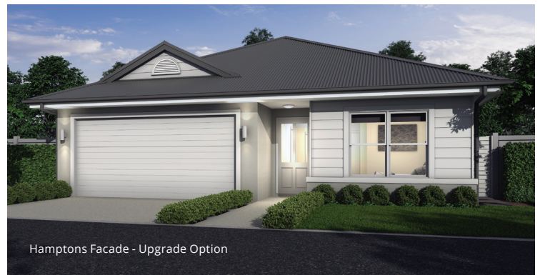
Hamptons Facade - Upgrade Option