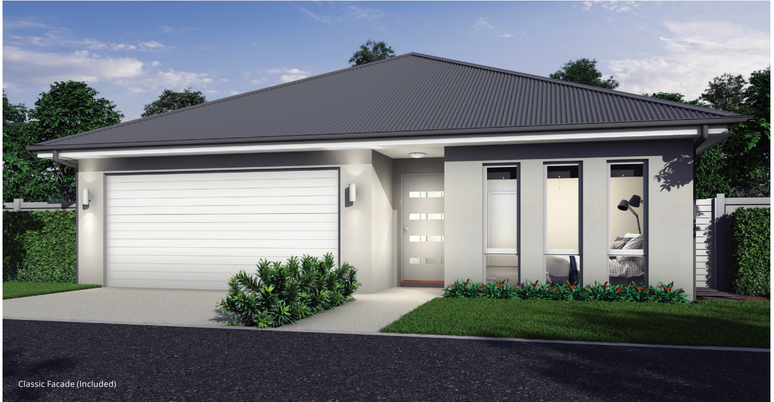
Classic Facade (Included)