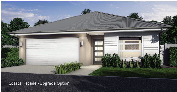
Coastal Facade - Upgrade Option